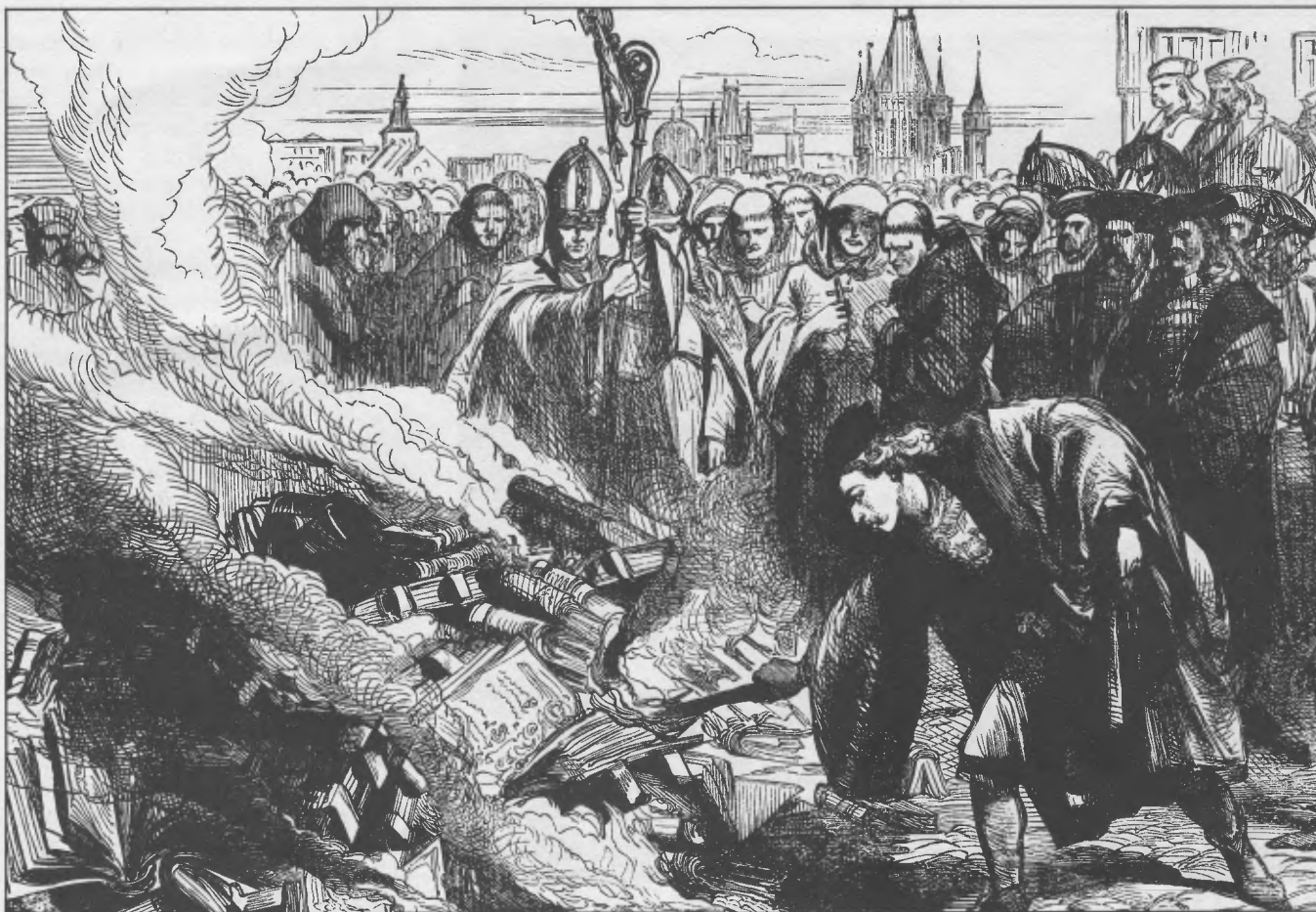
DESTRUCTION of the works of Wyclif at Prague.

Others also found it dangerous to be too closely identified with the translation or circulation of the English Bible. Coverdale narrowly escaped with his life; Cranmer and Rogers were brought to the stake; many others sought safety in flight. Even men who bought or sold these early English Bibles were threatened, sometimes tried for heresy, sometimes put to death. □