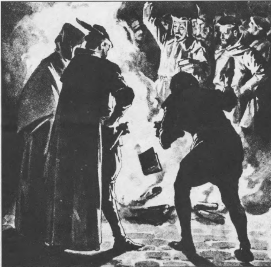
WILLIAM TYNDALE’S translation of the Scriptures are shown being burned. Vigorous measures were taken to find thousands of copies, which were burned in solemn ceremony. This was called “A burnt offering most pleasing to Almighty God.”

More complete coverage of the whole subject is available in our free article, “Which Translations Should We Use?”